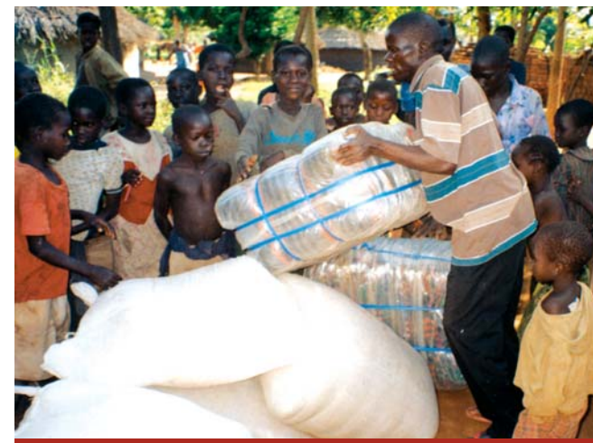
RELIEF GOODS ARE DISTRIBUTED DURING A FAMINE IN KENYA