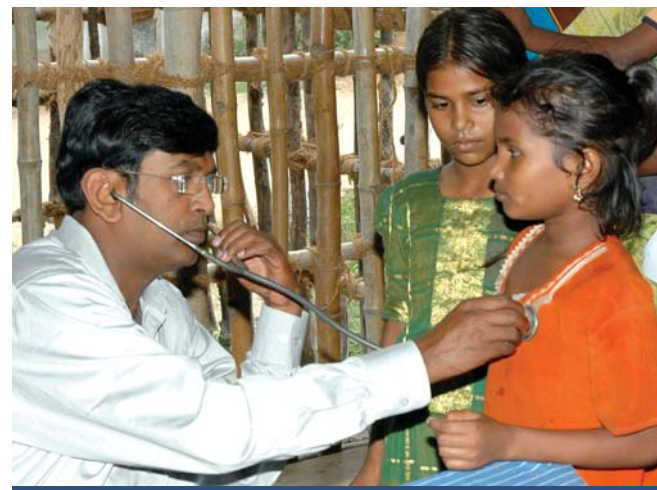
ONE OF CHILDCARE'S DOCTORS EXAMINES A CHILD AT A MEDICAL CAMP IN INDIA

• Located in the triangle between the islands of Bohol, Leyte and Cebu are hundreds of small islands that thousands of people call home. Before Childcare started working there, these islands had been unreached by the Gospel. • Evangelists with motorized outrigger boats called Island Shepherds now make their rounds on a regular basis. The response of the people to the Gospel has been overwhelmingly positive.